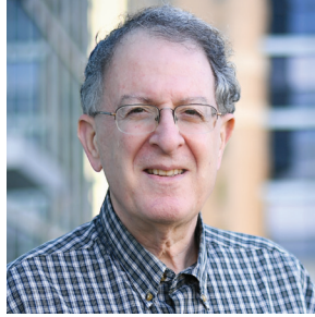
JEFFREY GORDON MICROBIOME RESEARCH

Uses visual design to make health data more meaningful.