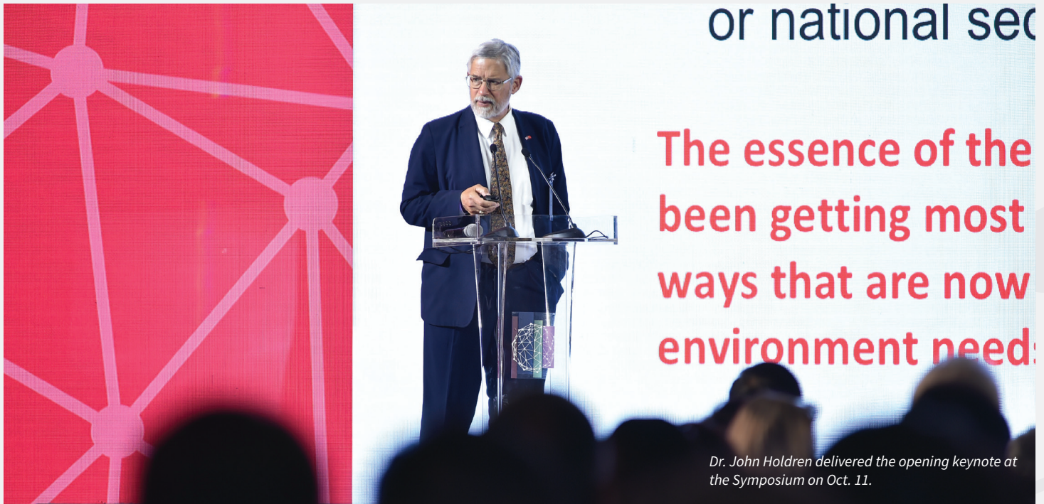
Dr. John Holdren delivered the opening keynote at the Symposium on Oct. 11.