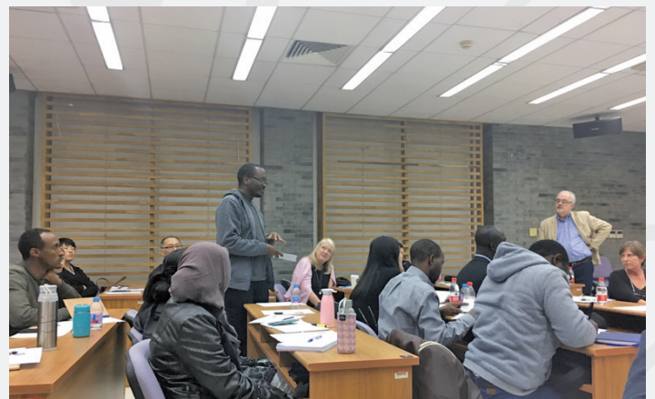
Students from Tsinghua University's International Master of Public Health program took part in the workshop discussions.