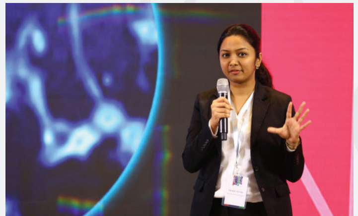
Students from McDonnell Academy partner institutions took part in a 3-Minute Thesis (3MT®) competition during the symposium.